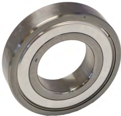
High Speed Deep Groove Ball Bearing